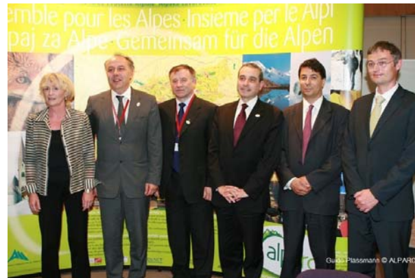
Signature Memorandum of Understanding